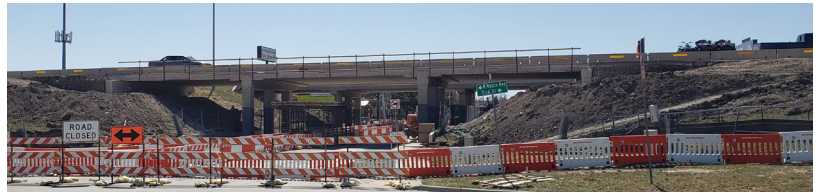
Demolition of parts of the Maple Avenue bridges continued. A canopy was also constructed beneath the bridge to protect pedestrians and bicyclists from potential falling debris.