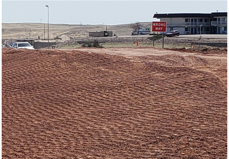
To date, approximately 57,600 cubic yards of borrow has been imported to widen the westbound I-90 Exit 59 approach lanes to ultimately connect with the interchange over the LaCrosse Street bridge.

Maple Avenue bridge abutments will be extended and the bridge deck widening will commence.