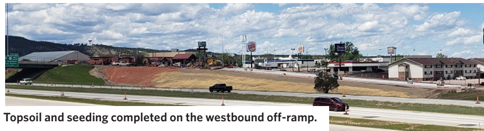
Topsoil and seeding completed on the westbound off-ramp.