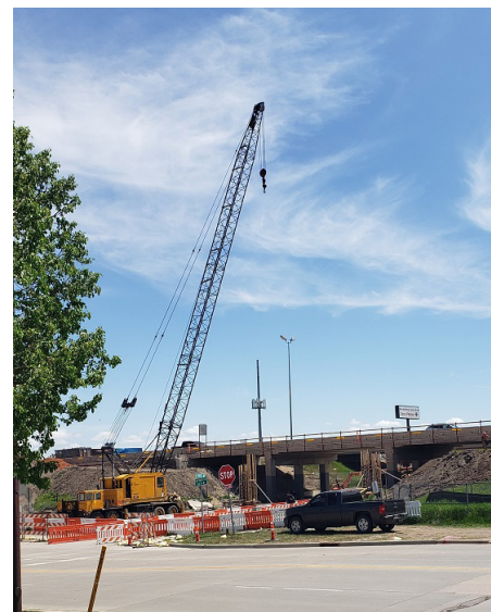
Pilings for the Maple Avenue bridges widening task will continue to be installed by using a crane to drive piling to a depth to reach load bearing capacity. To date, four pilings have been installed.