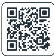
This QR code links to the www. I90lacrosseddi.com website and shows video animation of how traffic will flow through the DDI.