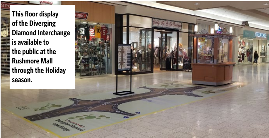
This floor display of the Diverging Diamond Interchange is available to the public at the Rushmore Mall through the Holiday season.

A public meeting will be held for the second construction season. We anticipate this meeting will be held in late February 2022.