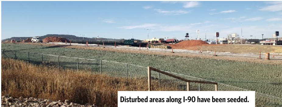
Disturbed areas along I-90 have been seeded.