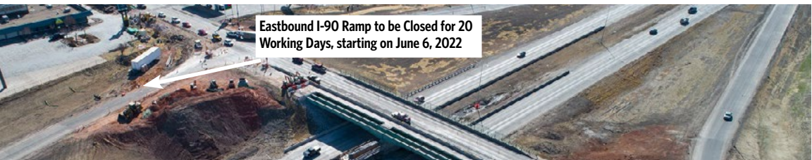
Eastbound I-90 Ramp to be Closed for 20 Working Days, starting on June 6, 2022