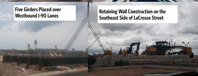
Five Girders Placed over Westbound I-90 Lanes